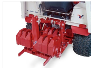
Optional Weights (up to six 42lb weights)

All specifications subject to change without notice or obligation